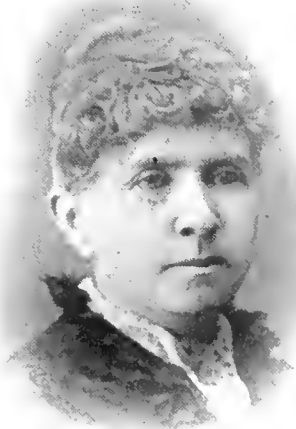
FRANCES FULLER VICTOR.

VICTOR, Mrs. Frances Fuller , author, born in Rome, N. Y., 23rd May, 1826. Her maiden name was Fuller. Her father was of an old Colonial family, some of whom were among the